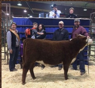
2017 Donation Heifer