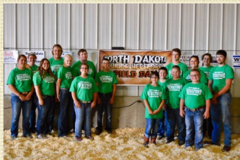
Junior Field Day Group