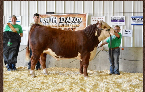
Champion Bull—Dylan Cargo