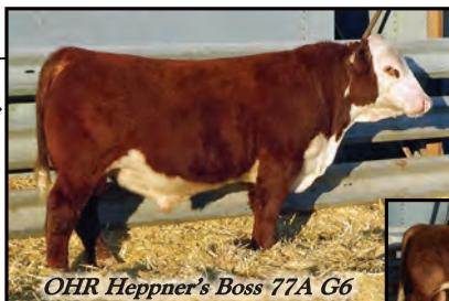
OHR Heppner's Boss 77A G6

Frontier son from a great Ribeye granddaughter with a 106.3% WWR on 7 calves. Grandmother 104.2 on 11! He is Homo polled, fully pigmented and well muscled! Redeye (the maternal grandsire) was our high performer and sold for $10,000 in our Red Power Sale! Top 1% WW, YW, M&G, and Milk. Owned with Prause PH in TX and Heppner Farms - Isanti, MN.