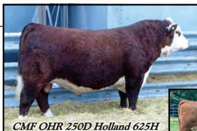
CMF OHR 250D Holland 625H

Homozygous Polled, fully pigmented, well made bull with very balanced data & great EPD's. BW 79, WW 760, YW 1312, REA 14.85, IMF 4.11. Dam ratios 104.3 on 4 calves at weaning and 110 on IMF. He is in the top 10% for 13 Traits with a 10.5 CED (top 5%) and 106 Carcass Wt. (top 1%). Owned with Candy Meadow Farms. Semen and embryos for sale.