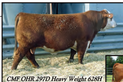
CMF OHR 297D Heavy Weight 628H

Big time carcass bull with a 16.13 REA & 3.83 IMF with the EPD's to back it up! BW 78, WW 816, YW 1362. Dam has a great ratios on 4 calves: 110 WW, 109.8 YW, 107.3 REA and 107.5 IMF! He is in top 5% of breed for 9 traits and top 1% for 6 of them! Homozygous Polled with full pigmentation. Owned with Candy Meadow Farms.